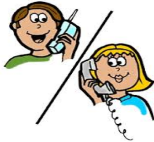
Call a Friend