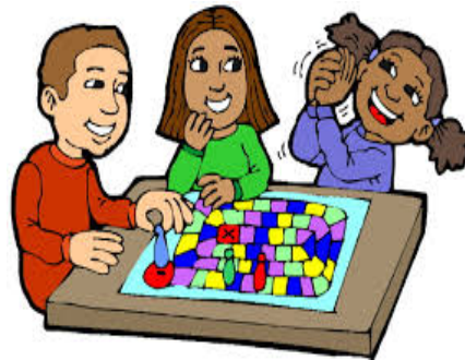
Play a Game