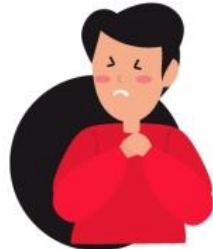
Out of breath